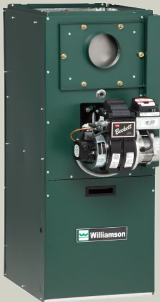
Up flow or Counter flow

70,000 to 112,000 Btuh Input 0.50 to 0.80 GPH #2 Fuel Oil