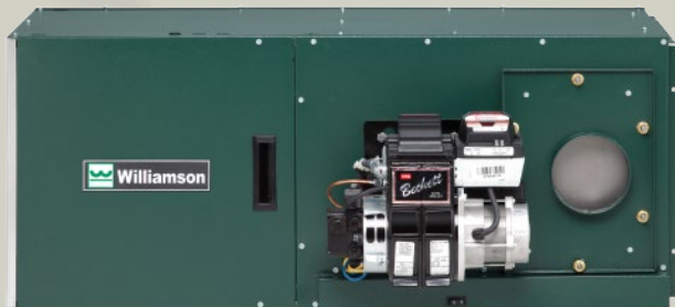
Horizontal - Left or Right