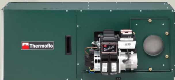
Horizontal - Left or Right