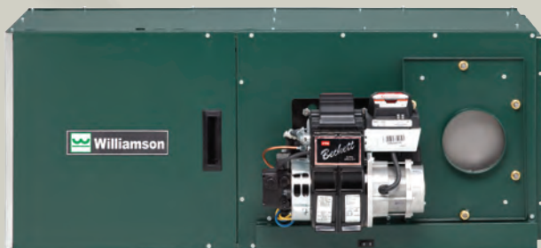
Horizontal - Left or Right