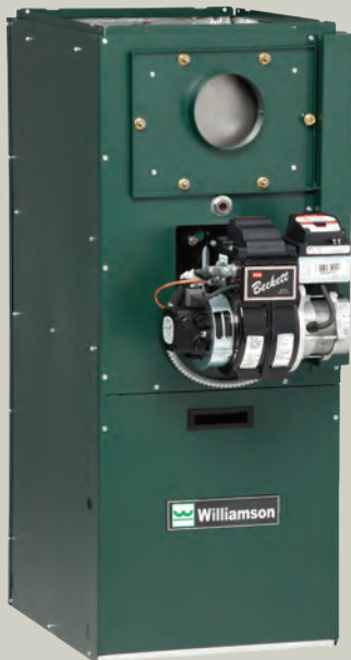
Up flow or Counter flow

70,000 to 112,000 Btuh Input 0.50 to 0.80 GPH #2 Fuel Oil